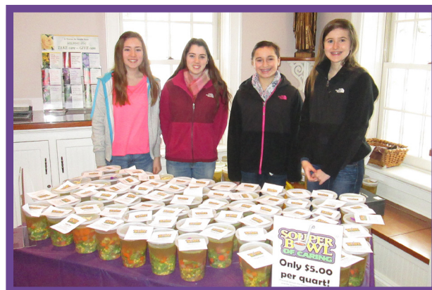
St. Thomas the Apostle Church in Oxford, CT