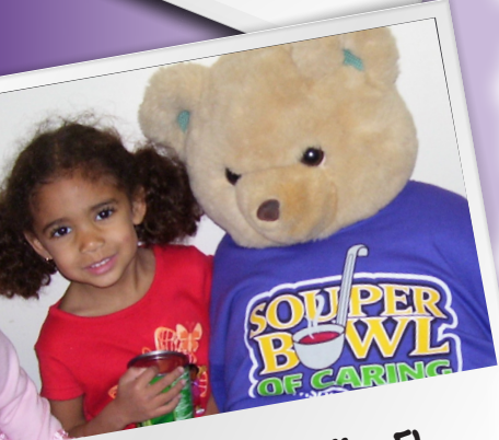
2008, Jacksonville, FL