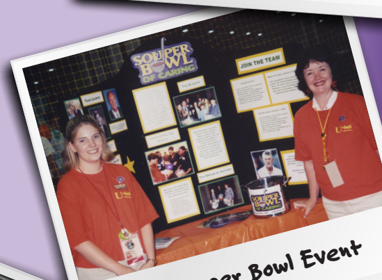
2004, Super Bowl Event