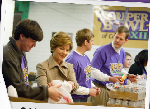
2004, Laura Bush @ Central Food Bank, D.C.