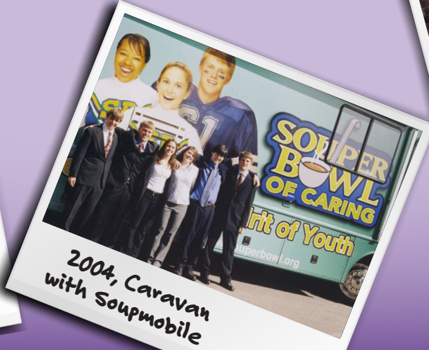
2004, Caravan with Soupmobile

Uniting communities and empowering youth to tackle hunger.