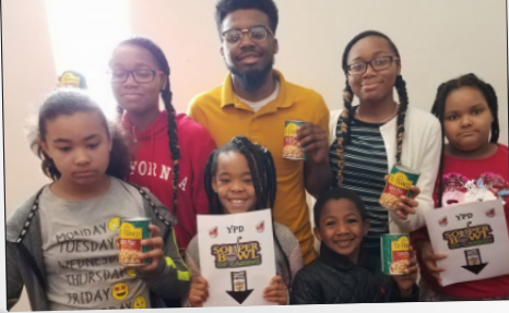
2020, YPD @ Bethel-Madison, IL