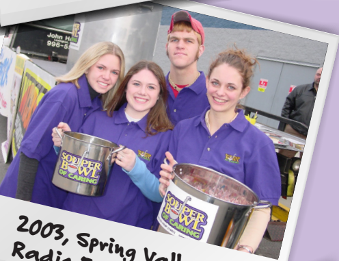
2003, Spring Valley Pres Radio Event