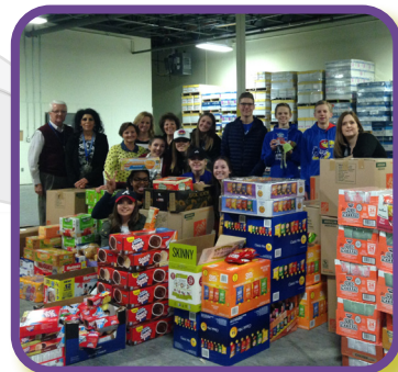
Jordan Education Foundation's, Souper Bowl of Caring campaign, Salt Lake City, UT