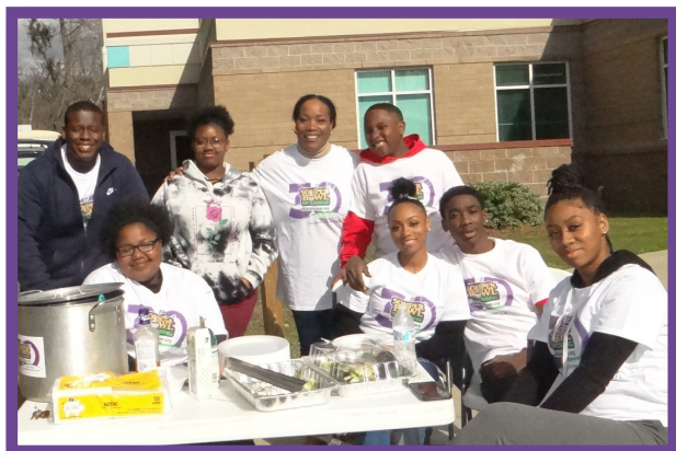
Marion Area YPD in Conway, SC

in food and monetary donations have been reported through the national Souper Bowl of Caring campaign since it's inception.