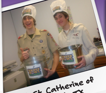
2008, St. Catherine of Siena Parish, TX