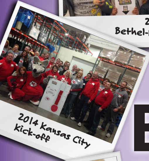
2014 Kansas City Kick-off