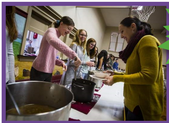
First Presbyterian Church, Newton, NJ

Since 1990, Souper Bowl of Caring has inspired people to care for one another, united communities and helped us to “be mindful of those that do not have a bowl of soup to eat” during the time of the Big Game. Let us continue to give and serve for those in need beyond the bowl.